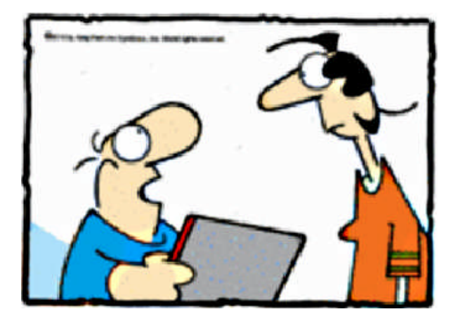
"The best thing about my new tablet Computer? Most people never Notice it's an Etch-a-Sketch"