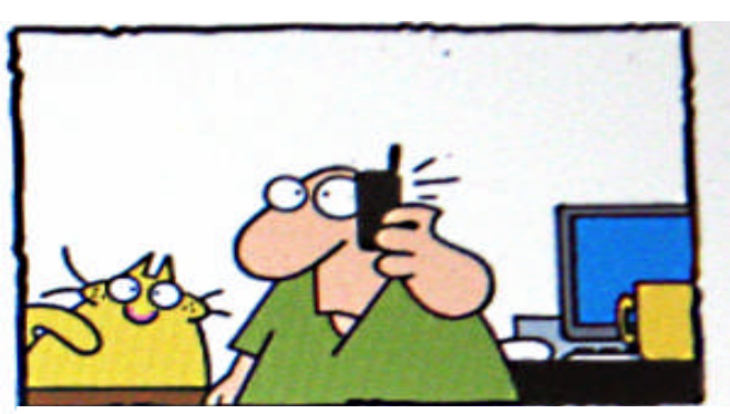
"This call may be recorded so we can Play it back for laughs during our break."

Negative image. A man accused of installing a camera in a women's restroom at a grocery store last week reportedly photographed himself while he was doing it. The man from Newton, Iowa, has been charged with invasion of privacy. He was an employee of the grocery store at the time of his arrest. The charge is a serious misdemeanor. The maximum penalty is a fine of up to $1,875 and up to a year of incarceration. The miniature camera, initially believed to transmit video images over the Internet, was found Jan. 27. It was attached to a fluorescent light fixture in the female employees' restroom. It turned out it was not transmitting images, police said Thursday. It was self-contained. Officers were able to view the suspect allegedly setting it up. The suspect has not worked at the grocery since the incident, the company said. The man, who could not be reached, did not provide information about the crime. Des Moines Register, Feb. 4, 2011