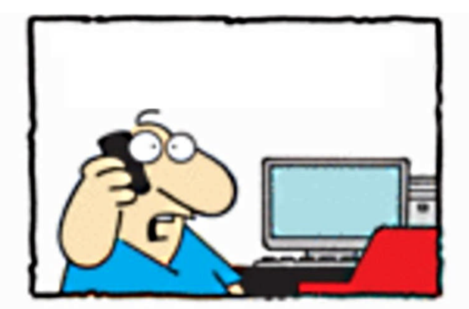
"Mom, I'm 50 years old --- you can remove the parental controls from my computer!"