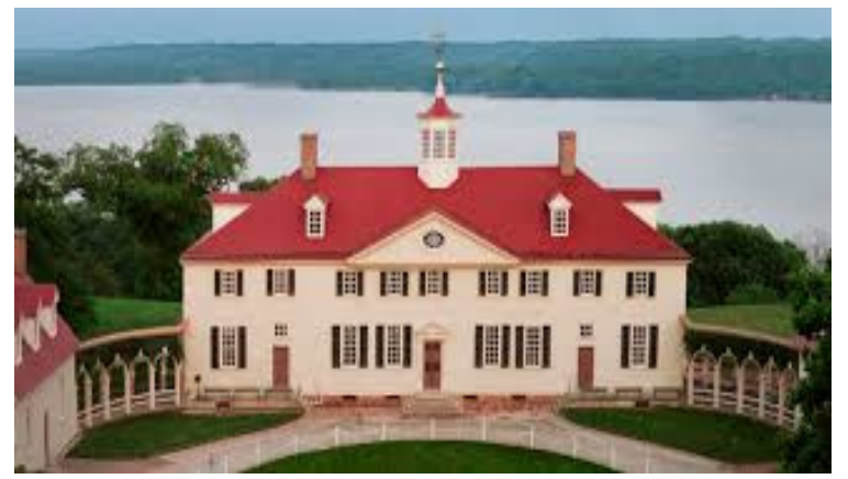
Mount Vernon George Washington's Home http://www.mountvernon.org/ http://tinyurl.com/yd86fwky

The Man & Myth <a href="http://www.mountvernon.org/george-washington/the-man-the-myth/">http://www.mountvernon.org/george-washington/the-man-the-myth/</a> Cherry Tree Myth · George Washington's Mount Vernon <a href="http://www.mountvernon.org/digital-encyclopedia/article/cherry-tree-myth/">http://www.mountvernon.org/digital-encyclopedia/article/cherry-tree-myth/</a> Martha Washington <a href="http://www.mountvernon.org/george-washington/martha-washington/">http://www.mountvernon.org/george-washington/martha-washington/</a>