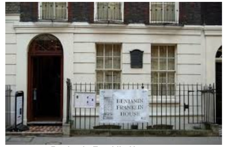
Benjamin Franklin House <a href="http://www.benjaminfranklinhouse.org/">http://www.benjaminfranklinhouse.org/</a>