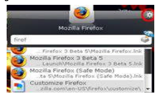
Figure 1: Launchy in action

Launchy's settings can be accessed by rightclicking on the Launchy window anywhere outside the text box and selecting "Options." Launchy is skinable, and some skins have an option icon on them. In Figure 1, the options icon is circled in red. Regardless of how you access the options, there are five tabs to browse through.