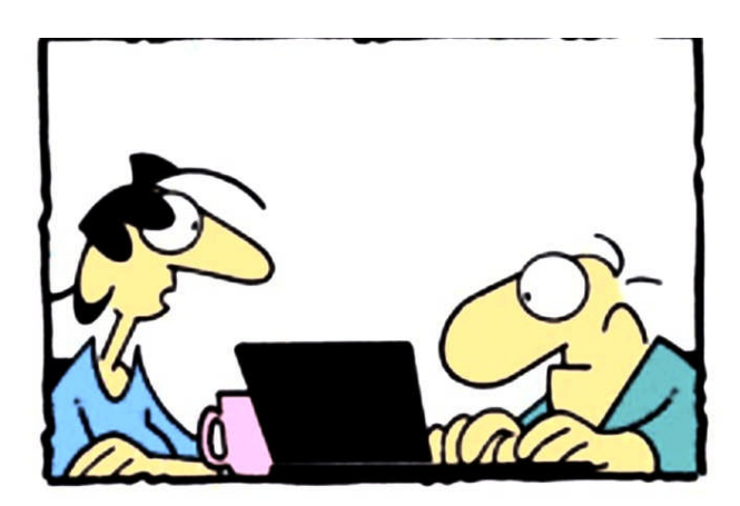
"Yelling at the screen won't help. Try yelling at the keyboard."

A Michigan university has determined that about 7,700 students got email notices kicking them out of school for bad grades -- a message intended for only 100 students. Eastern Michigan said that the incorrect emails were sent by a third-party provider. The school president apologized for the email, calling it an "inexcusable mistake." The email starts by telling the <u>students</u> that as a result of their "academic performance," they've been "dismissed from Eastern Michigan University." It also mentions a way for students to appeal. Associated Press